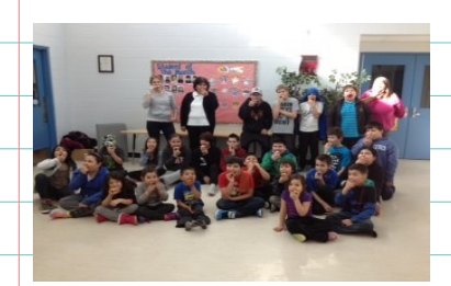
Great Big Crunch