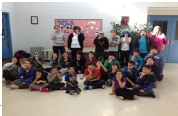
Great Big Crunch